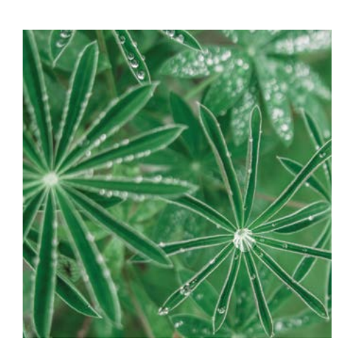
Half-yearly Financial Report 2024